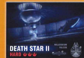
DEATH STAR II [MILLENNIUM FALCON] HARD