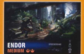
ENDOR [SPEEDERBIKE] MEDIUM