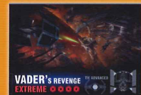
VADER'S REVENGE [TIE ADVANCED] EXTREME